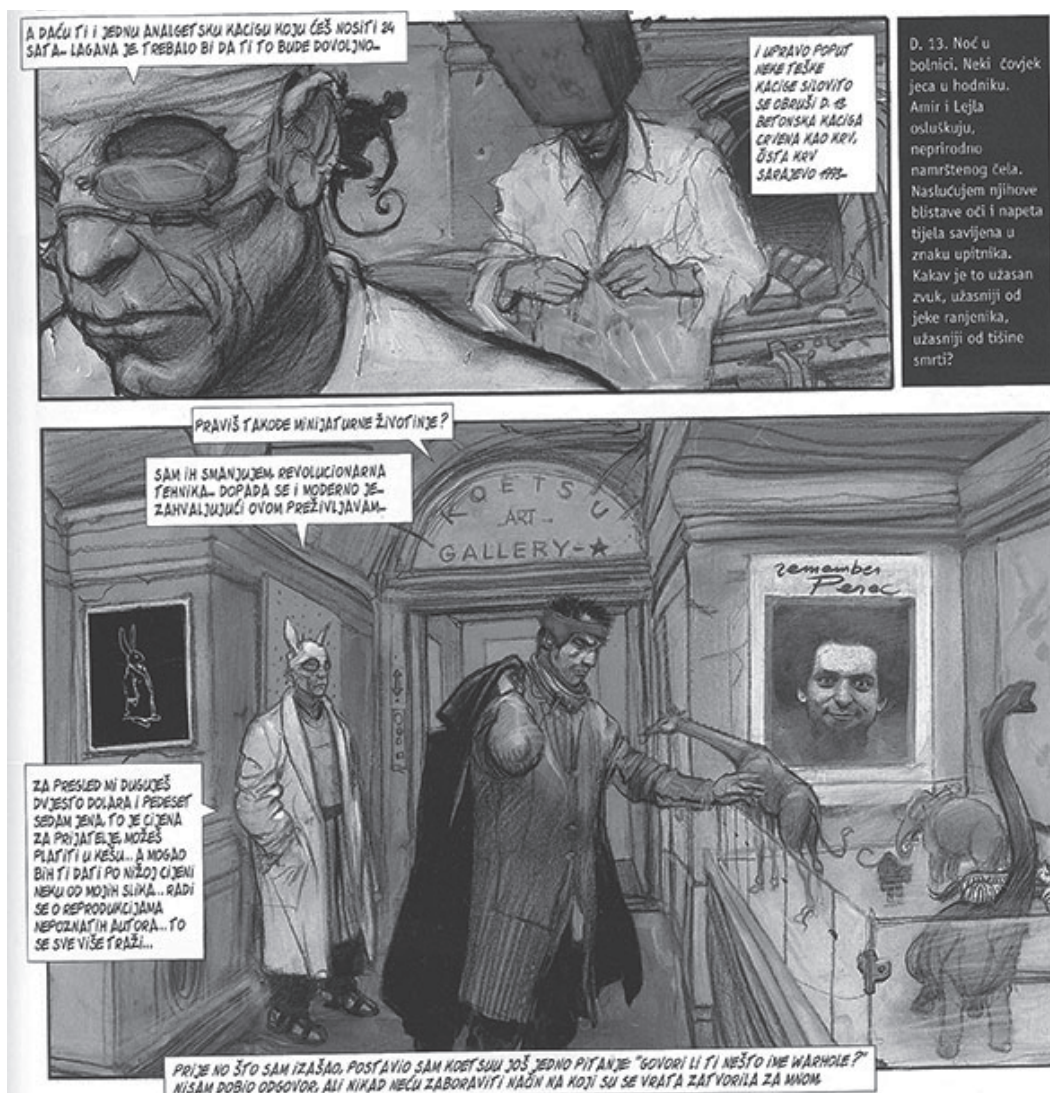
Figure 3: The Dormant Beast (Bilal 2002, 35)

bank of “purely virtual images which have been constantly preserved through time” (Deleuze 1989, 80). A leap into the past; or Nike is placing himself in the virtual (Deleuze, 1988, 57). Only after this “jump” is made, Deleuze argues, recollection-image is actualized, embodied (ibid., 63), and this is when Nike’s penetrating pain, as the psychological contraction (translation) in recollection of the past, starts unfolding.