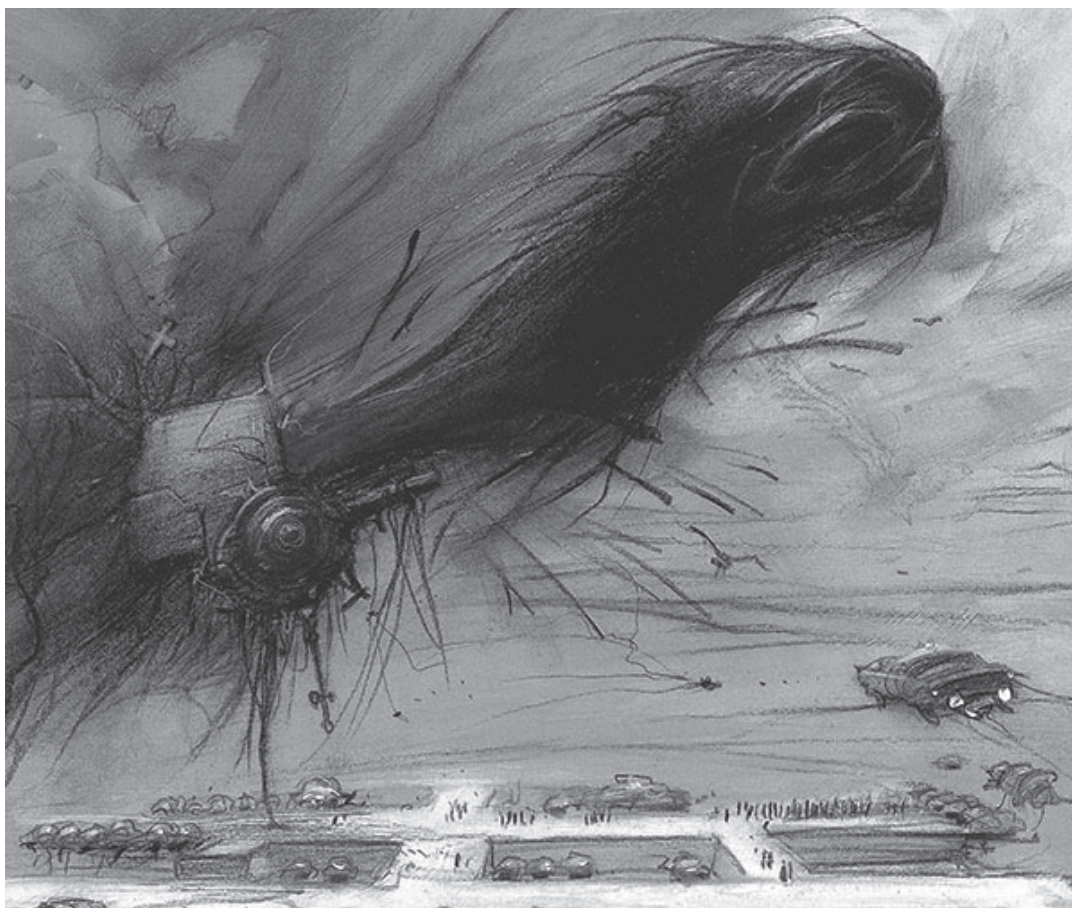
Figure 1: Scream (Bilal 2003, 43)

that life and art and life-art detect, flush out and make visible through spilled red of blood, black of “scream” (Figure 1). What is given is a piece of chaos in art, art within chaos, and chaos in oneself—giving rise to life, to sensation, to meaning. To compose precepts and affects entails approaching this outside of perceptions and affections, Irigaray’s sensual transcendental. The shape of delirium tattooed on the canvas, preserved as a block of sensations. To create this monument is to create a universe, or as Lorraine writes, “the embodiment of an aesthetic possibility drawn from virtual chaos” (Lorraine 1999, 210). In creating the embodiments of sensation, Bilal rethinks the trajectories of love and ways of how we experience existence, creation, destruction, violence, how we feel, although at a proto-subjective level, within what Kennedy calls “the molecular structures of the autopoietic realms of our being,” our living with the world (Kennedy 2000, 147). An intruder who moves along the periphery of the zone interdite becoming minoritarian (n-1) embodies pure beings of sensation. Pink Panther. La Linea .