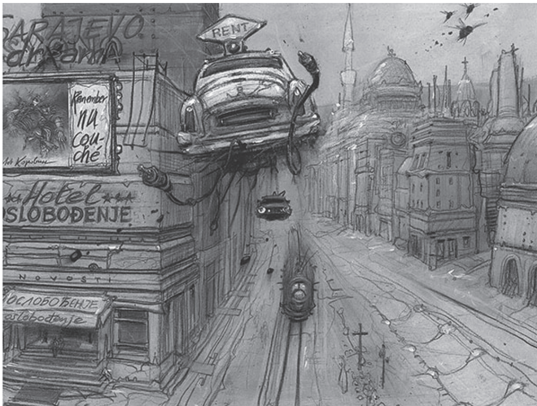
Figure 2: SarajevoDreamA (Bilal 2002, 58)

within the novel. In this midst of language torn of sense, there are images—as amalgamations of matter, image and movement, which form sequences of intensive states, and there is a political frame that is effectuated through the elements of art and sensation. After all, what is there not to be intensive in and about Sarajevo, Paris, Syria, Ferguson, today? Jingle bells and iron fences.